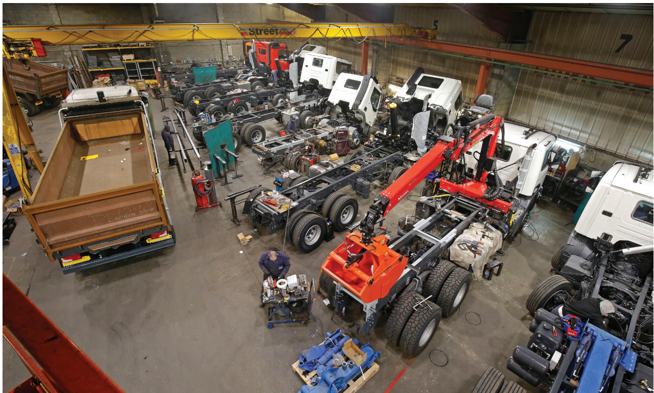
Assembling bodies in Croydon