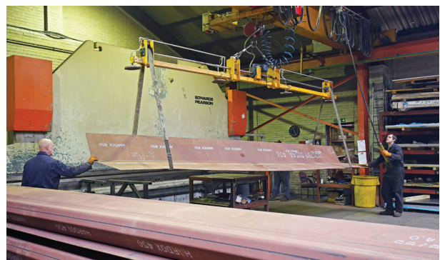
Single piece sides are pressed in Croydon