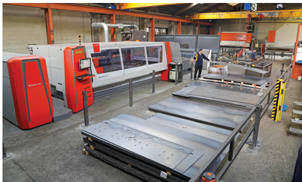
The Bystronic laser cutter in Croydon - a £450,000 investment