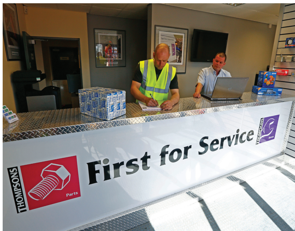
Thompsons provides 'whole life' customer support - nationwide

We provide the full range of Parts, from hydraulic seals to a complete sheeting system. Supplied either over the counter, by van delivery or via our unique internet based parts warehouse at www.thompsonseparts.co.uk Thompsons Service is also industry-leading, either at our workshops or on-site. Service is always when you need us, where you need us!