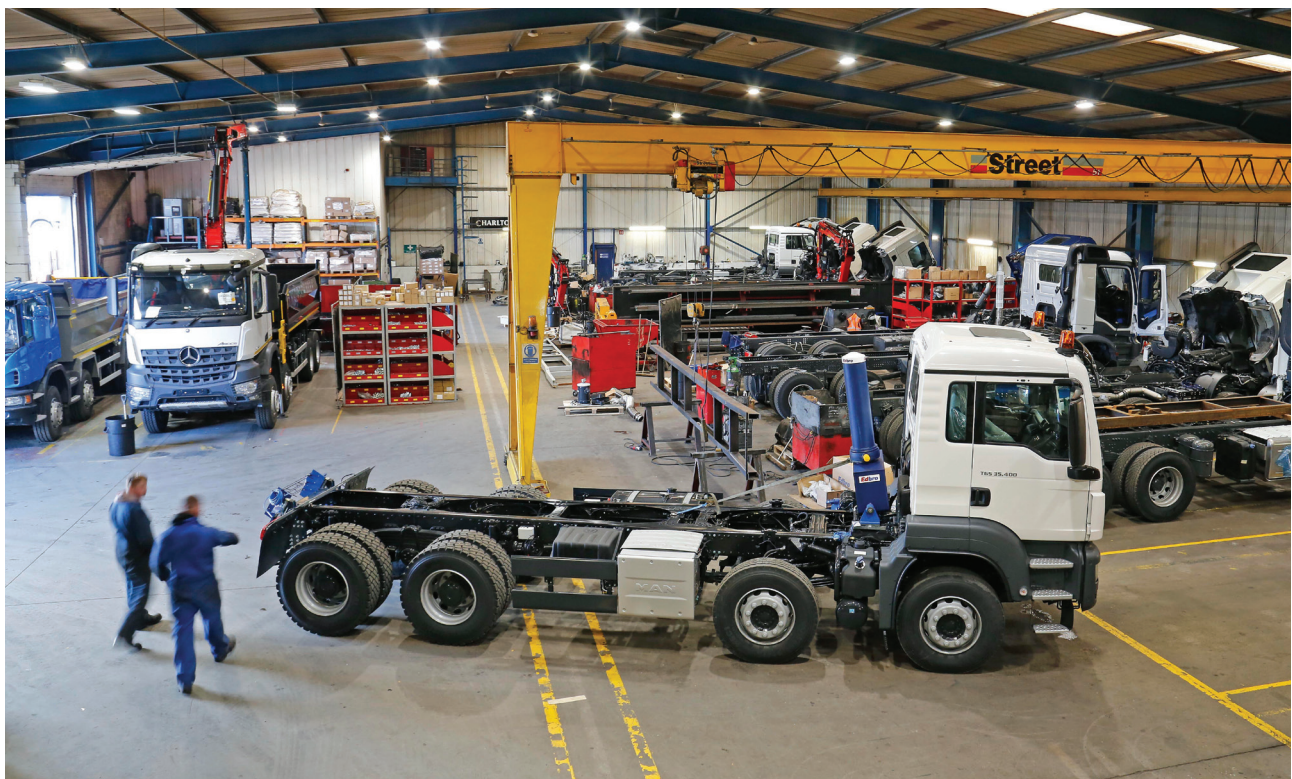
Blackburn Site 1 concentrates on fitting hydraulics