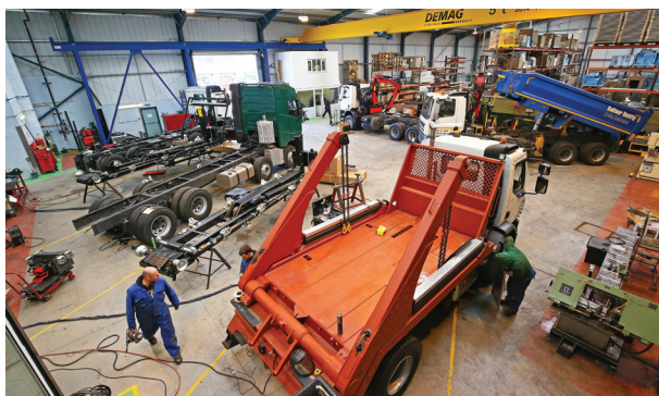
Blackburn Site 3 is our latest factory